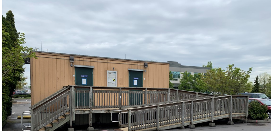
Existing Restroom-shower Facility

COMMISSION REQUEST TO INCREASE THE BUDGET FROM $285K TO $430K